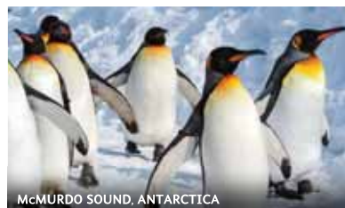
McMURDO SOUND, ANTARCTICA