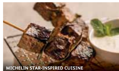
MICHELIN STAR-INSPIRED CUISINE