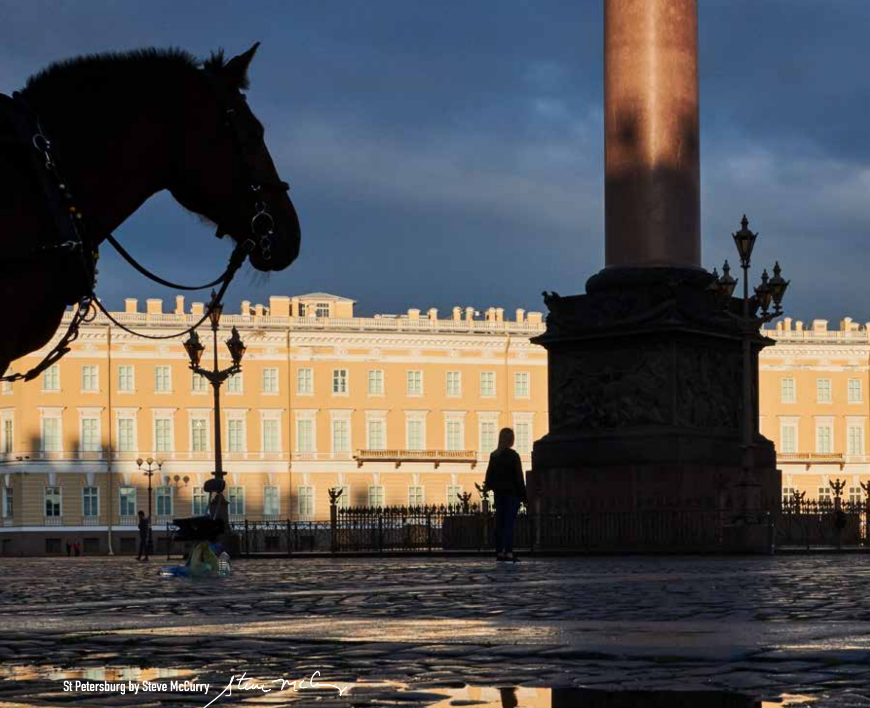
St Petersburg